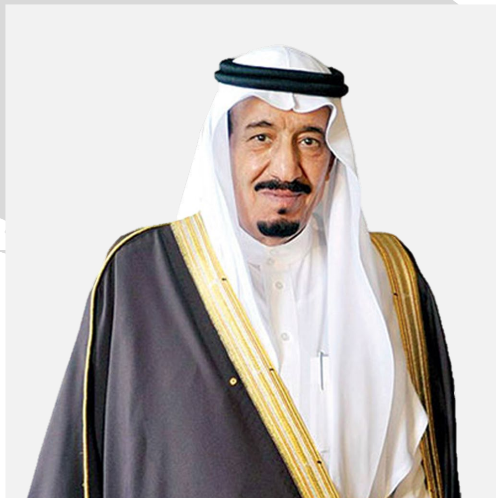
King Salman bin Abdulaziz Al Saud

Custodian of the Two Holy Mosques, The King of the Kingdom of Saudi Arabia