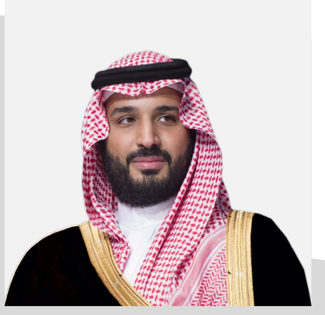
His Royal Highness Prince Mohammad bin Salman bin Abdulaziz Al Saud

Custodian of the Two Holy Mosques, The King of the Kingdom of Saudi Arabia