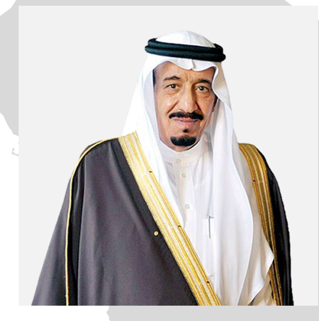
King Salman bin Abdulaziz Al Saud

Custodian of the Two Holy Mosques, The King of the Kingdom of Saudi Arabia